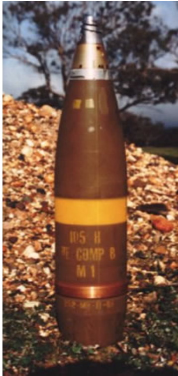
Projectile 105mm High Explosive