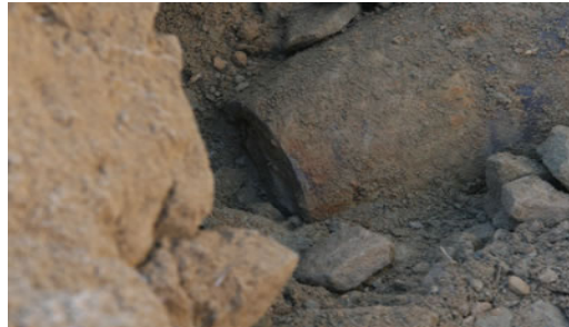
Live 60mm mortar High Explosive unearched at Tracadie Range, NB