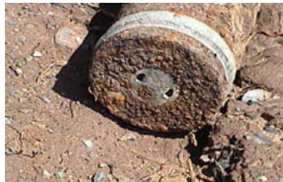
A piece of unexploded ordnance washed up on a beach.